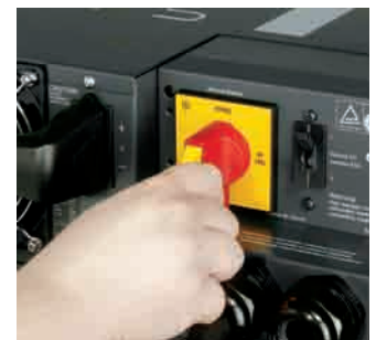
Hot-swappable I/O Box