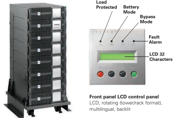
Front panel LCD control panel LCD, rotating (tower/rack format), multilingual, backlit