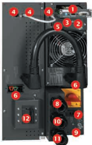
EX RT Back Panel (Battery Module /Power Module)