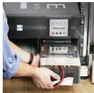
Clear coat battery packaging with thru holes for diagnostic and testing