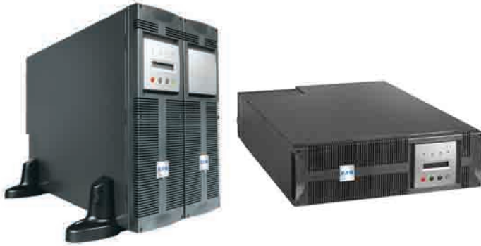
Versatile form factor

The Eaton® EX RT UPS is a UPS designed for sensitive high-density server environments and harsh industrial applications. Specifically engineered to meet demanding customer applications in IT systems, measuring instruments, PLCs and industrial PC markets, the EX RT is fully compatible with genset redundancy requirements in most instances. The manual bypass, hot-swap I/O box and intuitive LCD control panel are just a few of the many differentiating features that make the EX RT the ideal product for the 5–11 kVA power range.